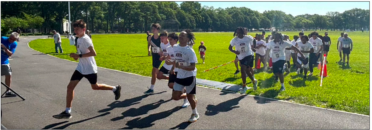
High school athletes were among the first to bolt out of the starting gate at the beginning of the race on June 21.