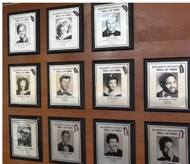
Several of the plaques in the gym balcony Hall of Fame.