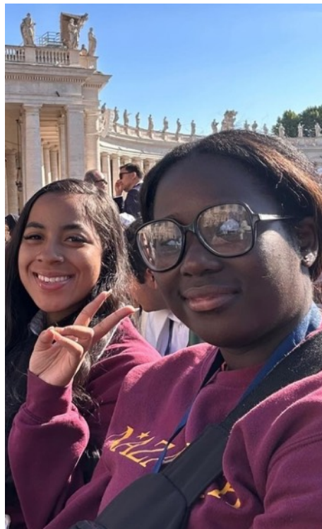
Nazareth students in St. Peter's Square.

Scholas is a global initiative created by Pope Francis in 2013 to allow high school students to connect with each other and their community from all backgrounds, cultures, and faiths.