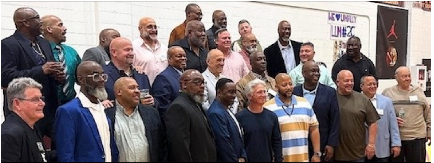
Members of both teams, plus a few friends, gather around coach during reunion. For more photos and some videos, click here .