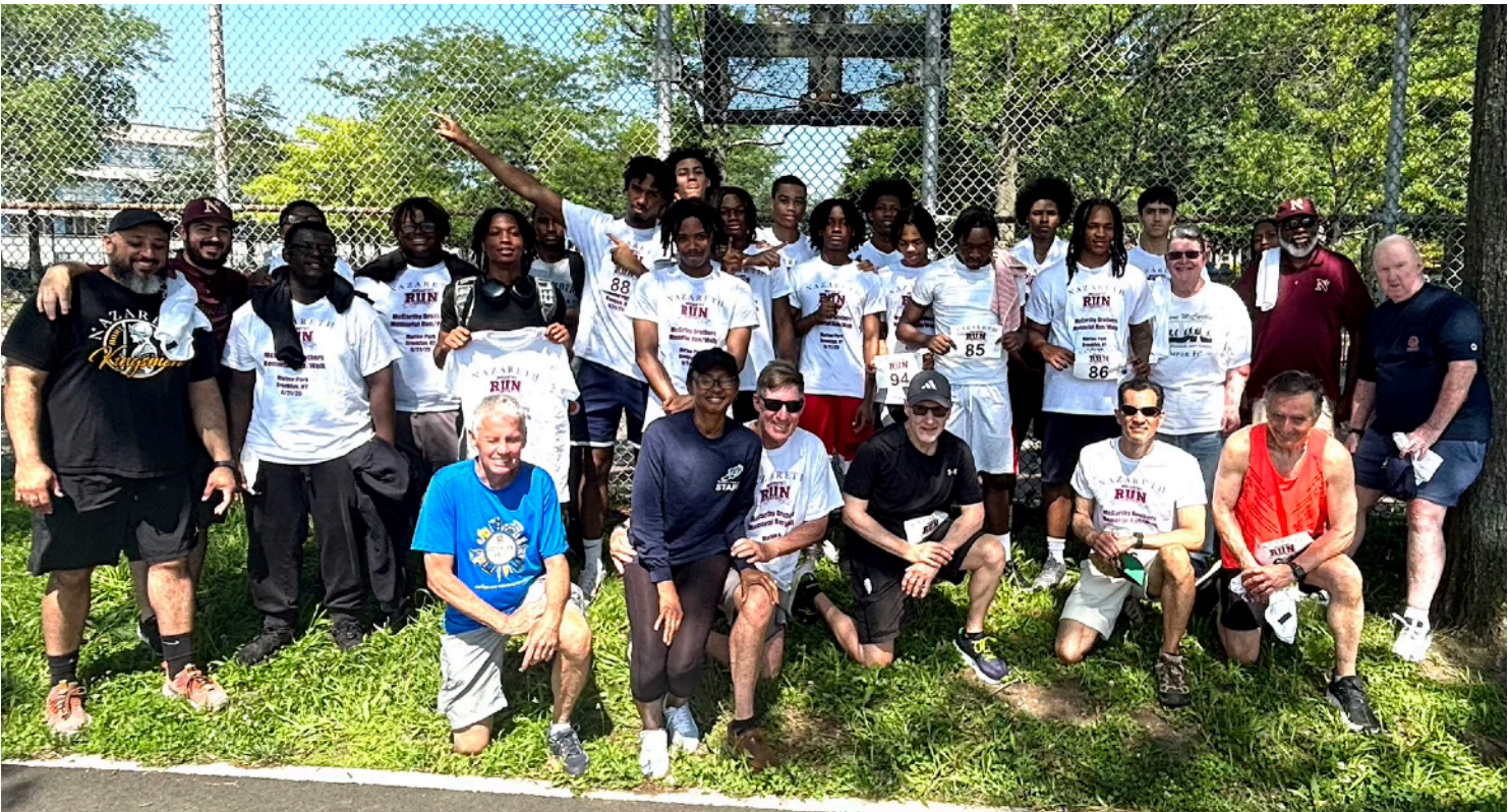
Nazareth students, staff and alumni gathered afterwards in a shady spot along the Marine Park path used for the McCarthy race.