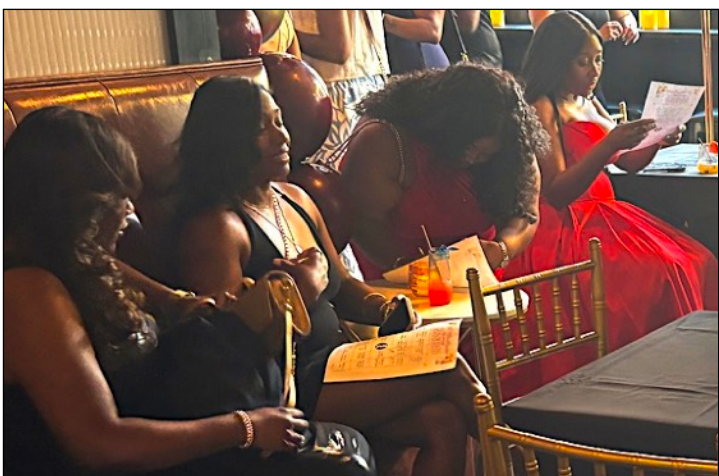
As an ice-breaker and to encourage mingling, early arrivals asked each other questions in a game of reunion bingo.