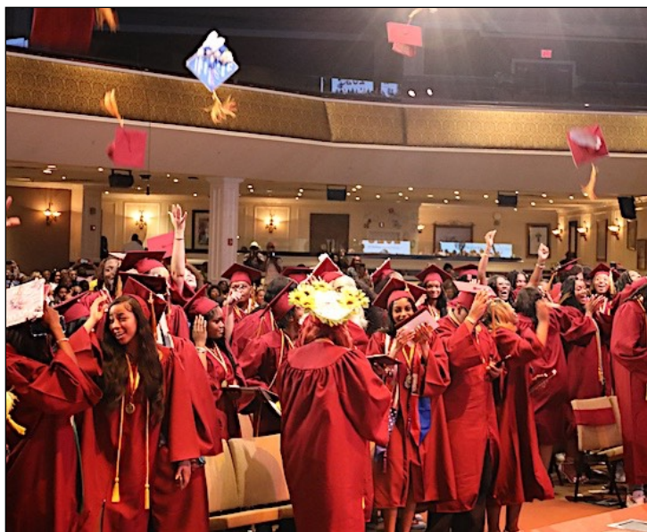
Graduation caps, some of them decorated, flew at the end.