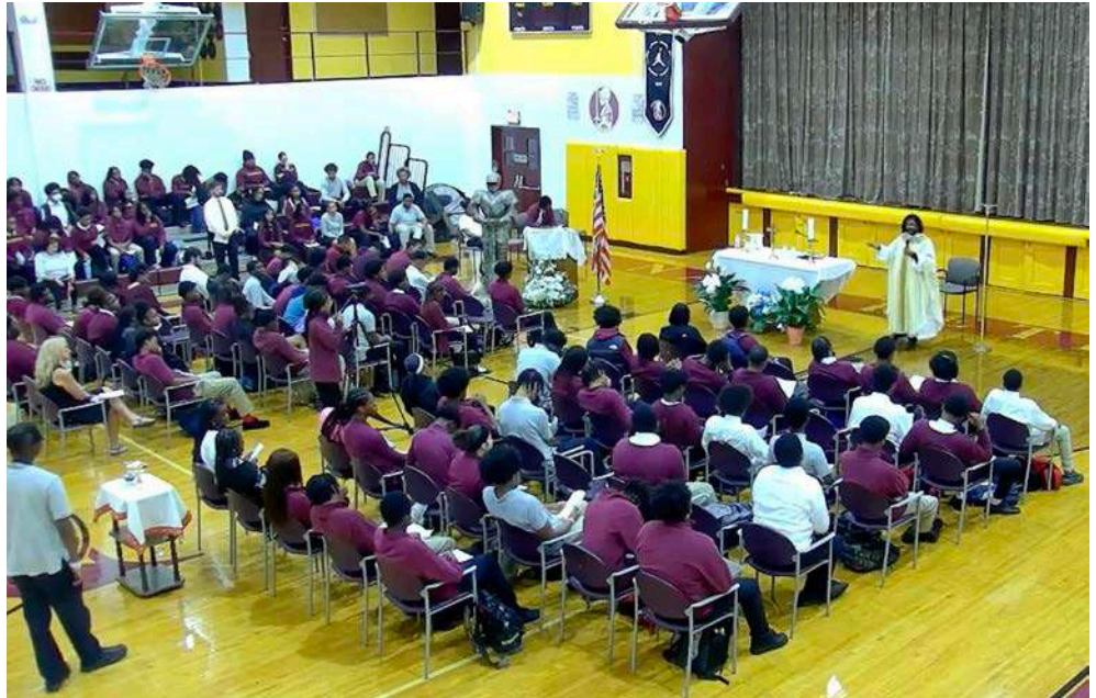
Students filled the bleachers and chairs set up in the gym for the Memorial Mass.

The school knows that so many others from our Nazareth community were not included and hopes to do this every year to remember those people as well.