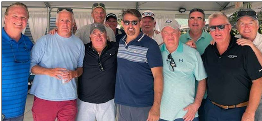
Several of the 80 golfers who turned out at the Marine Park course in September.

You can donate to the drive at any time at nazarethrhs.org/giving/spirit-of-nazareth/ . Thank you in advance.