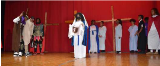
Stations of the Cross – March 27, 2024

The Online Nazareth RHS Student Newspaper