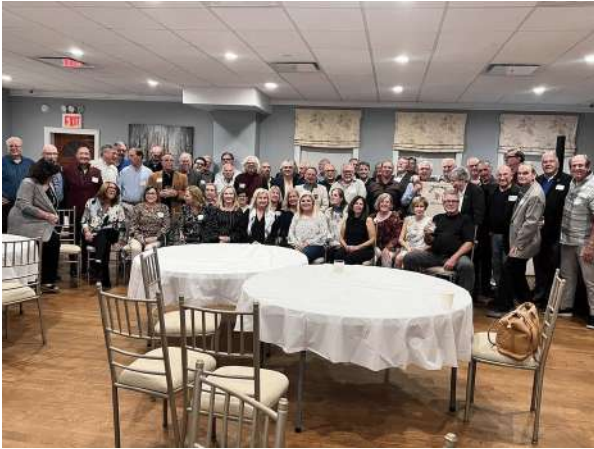
1973 – 50th Class Reunion held on 9/30/23 at the Belle Harbor Yacht Club. Wonderful time with over 60 attendees. Gracious donation from the class of '73 of $2,950 made to Nazareth's Lt Michael T. Russo Scholarship Fund.