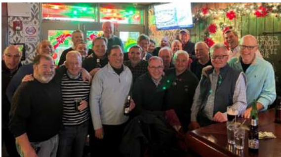
Flatbush Christmas Party 12/1/23 NYC