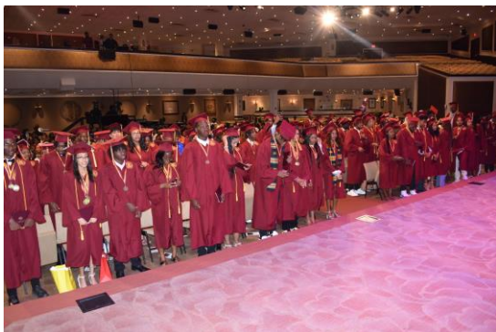
Graduation 2023 at Christian Cultural Center

The Online Nazareth RHS Student Newspaper