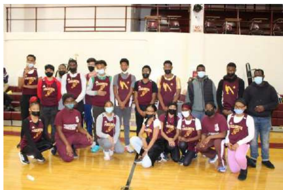
Naz Track Team 2021-22

You don't want to miss out on a chance to be a part of something special. So come and join Sisters Reaching Out ! It'll really change your experience in high school.