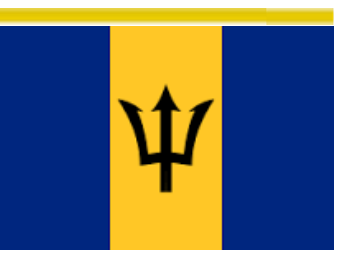
The national flag of Barbados.