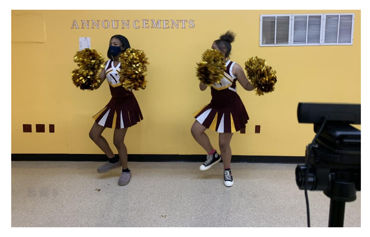
Cheerleading was the first sport to resume in person practices.

The announcement of Governor Cuomo allowing participation in high risk sports this season made me happy. I was excited to come back to school, play, and live the normal life before Covid-19, but with masks. Even though it feels different, it still feels good to be around my teammates, coaches, and teachers. My overall mental state has improved. Coming back to football practice made me realize the bigger picture of sports. It teaches discipline, hard work, and how to cope with the success and failure that we will face in life.