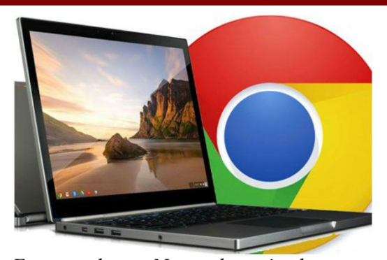
Every student at Nazareth received a brand new Chromebook at the beginning of the 2016-17 school year.

This year at Nazareth Regional High School, students were given the gifts of Samsung Chromebooks which are amazing! Fast, reliable, lightweight, and extremely easy to use, it's the ideal laptop for any student. With everything connected to Google, teachers and students can have their work done with ease. Tools like Google Classroom give students the ability to complete their work easily and hand it in without the hassle of losing papers or the assignments being ripped. On the downside, students don't really have the ability to have much leisure time on said Chromebooks. It's more of a schoolfriendly machine, than a regular computer, but that doesn't stop it from being a great machine. In my experiences with this laptop, I've yet to have any problems. In the last school that I went to, we had Chromebooks before but it was a different model. It was a Lenovo ThinkPad Chromebook which was fine. The only difference was the screen and the hardware included. In conclusion, the Samsung Chromebook is a wonderful laptop to use. I rate it a 4.7/5