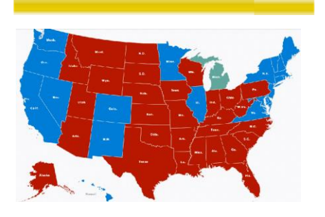
2016 Electoral College Results Map* Trump: 290 electoral votes Clinton: 232 electoral votes

*Michigan has yet to declare a winner for the state. Trump has a narrow advantage.