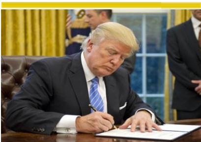
President Trump has faced many obstacles in passing his agenda.

The last time I checked, there is something called Federal Checks and Balances in the U.S. Constitution! Trump has even gone to the part where he questioned one of the Federal Judge's action towards his executive order. Which is unbelievable! The next step in this legal battle is likely the U.S. Supreme Court. This will be another issue because the court will have, most likely, a 4-4 vote. They would need one more vote in order to break the tie. Trump has nominated Neil Gorsuch to the Supreme Court to fill the vacancy of the late Justice Antonin Scalia. From the look of things, Democrats will make it extremely difficult to confirm him. We shall see.