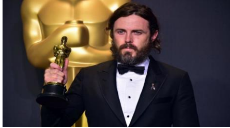
Casey Affleck won the Best Actor Oscar for his performance in the film.

Gone directed by Ben Affleck, just proves the capabilities of Casey.